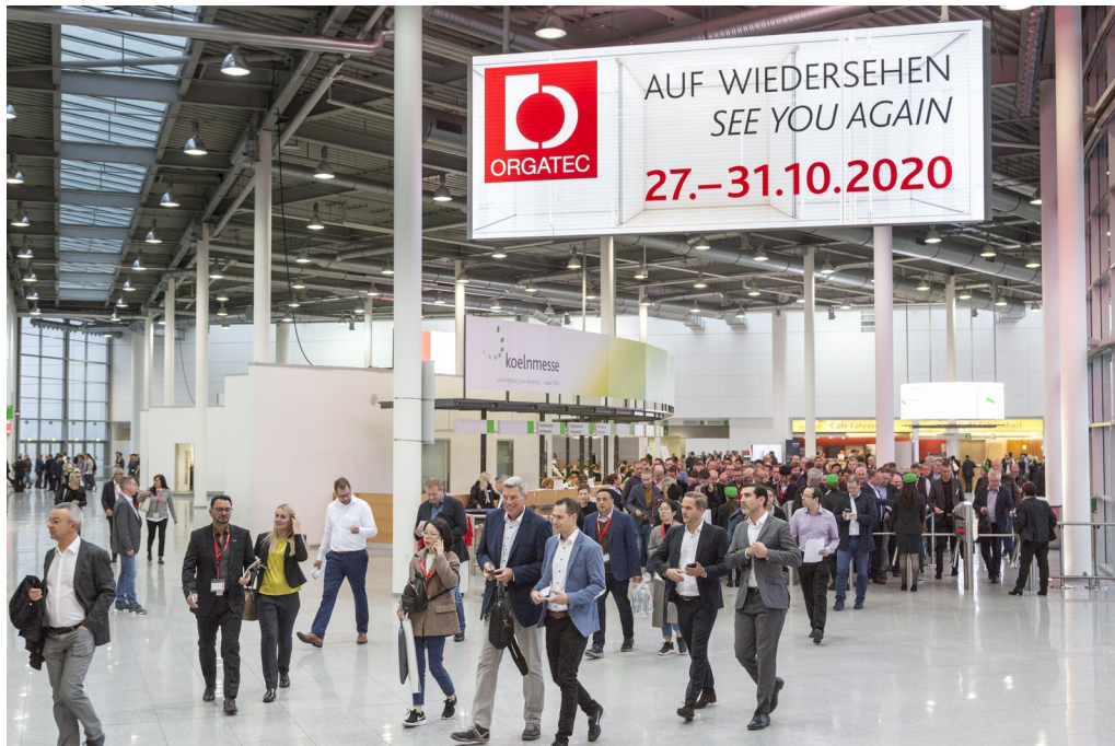
ORGATEC relies on FairMate, also for lead tracking by the exhibitors

Exhibitors can supplement the visitor data with additional, individual information such as memos of meetings, or define and then create categories using "tags". By using the FairMate LeadTracking App, there is no need to manually enter the contact data gathered later on and run the risk of making mistakes. The visitor data is available immediately in digital form for further sales and marketing activities.